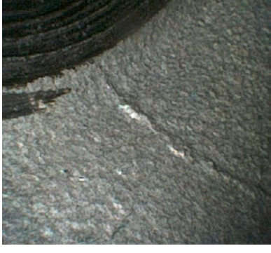
IPLEX TX (predecessor)